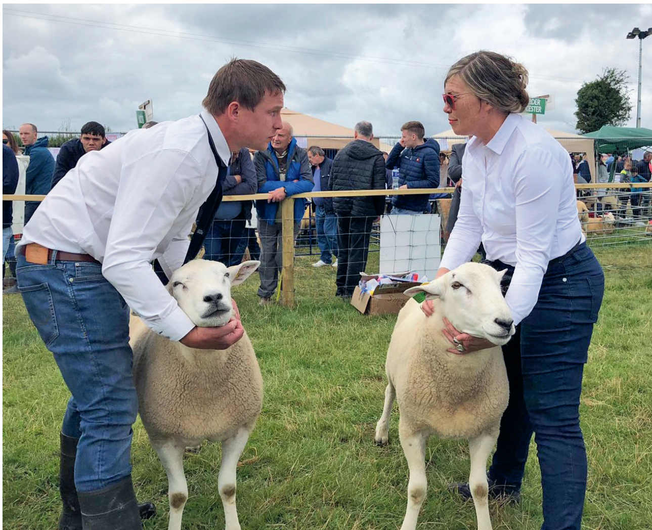
© Orla Barry / ADAGP Paris, 2025. Photo: Courtesy of the artist.