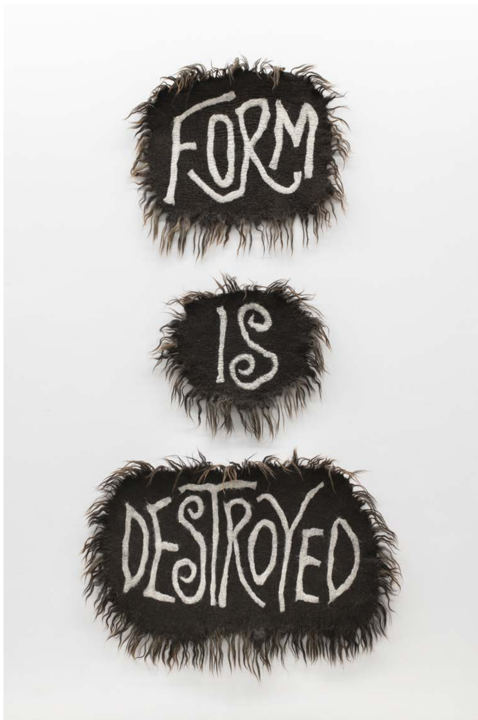
"Form is Destroyed", 2024. Felted raw wool from Tiroler Bergschaf, Lleyn, Merino and Drenthe Hearh sheep. Collection Musée des Arts contemporains au Grand-Hornu. © Orla Barry / ADAGP Paris, 2025.