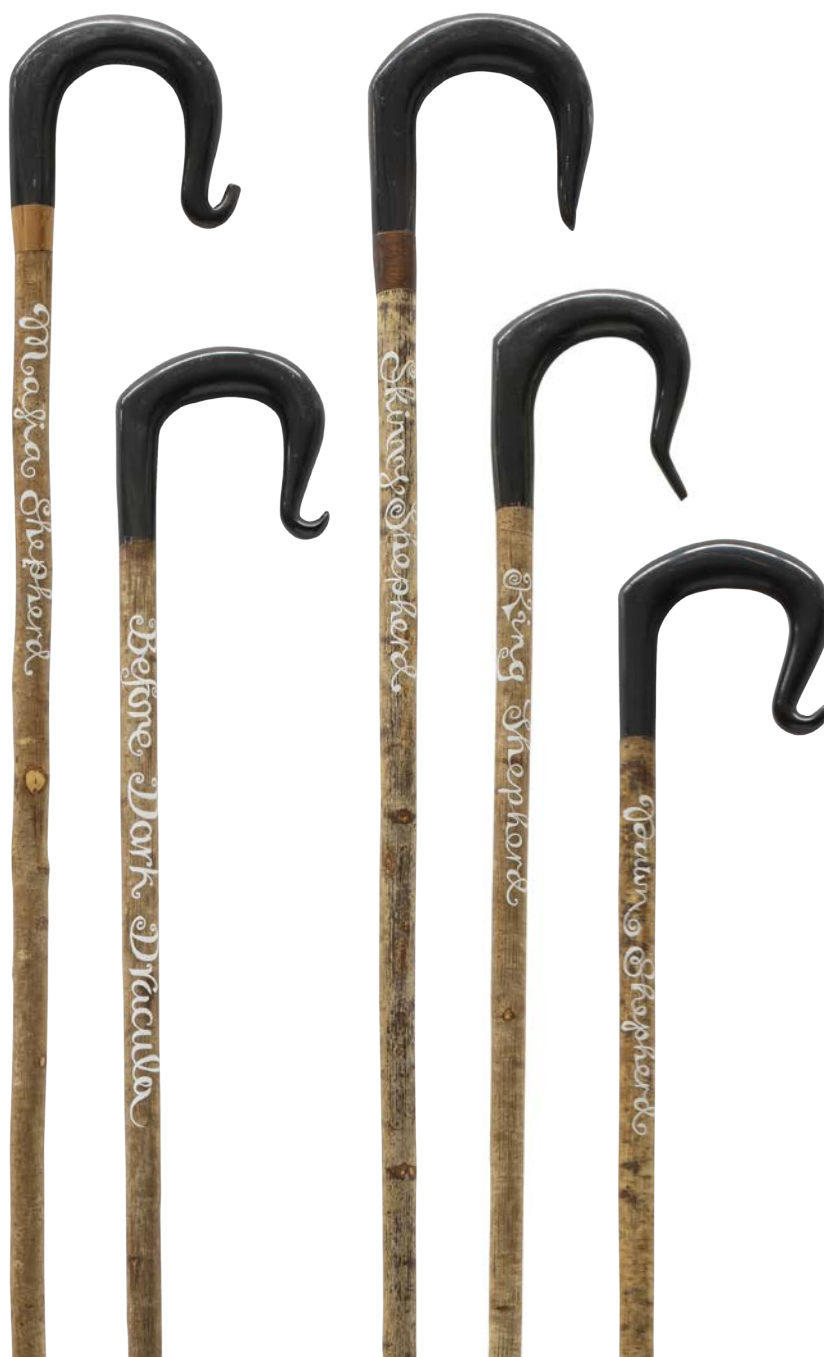
“Shaved Rapunzel’s Shepherds”, hand-painted shepherd’s chopsticks, wood, buffalo horn, ram’s horn, various sizes, 2019 © Orla Barry / ADAGP Paris, 2025.