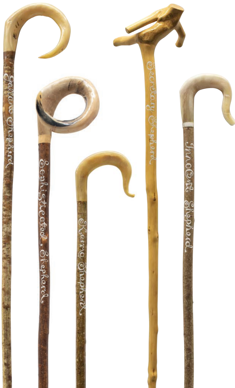
"Shaved Rapunzel's Shepherds", hand-painted shepherd's chopsticks, wood, buffalo horn, ram's horn, various sizes, 2019 © Orla Barry / ADAGP Paris, 2025. Credit: MACS Grand-Hornu.