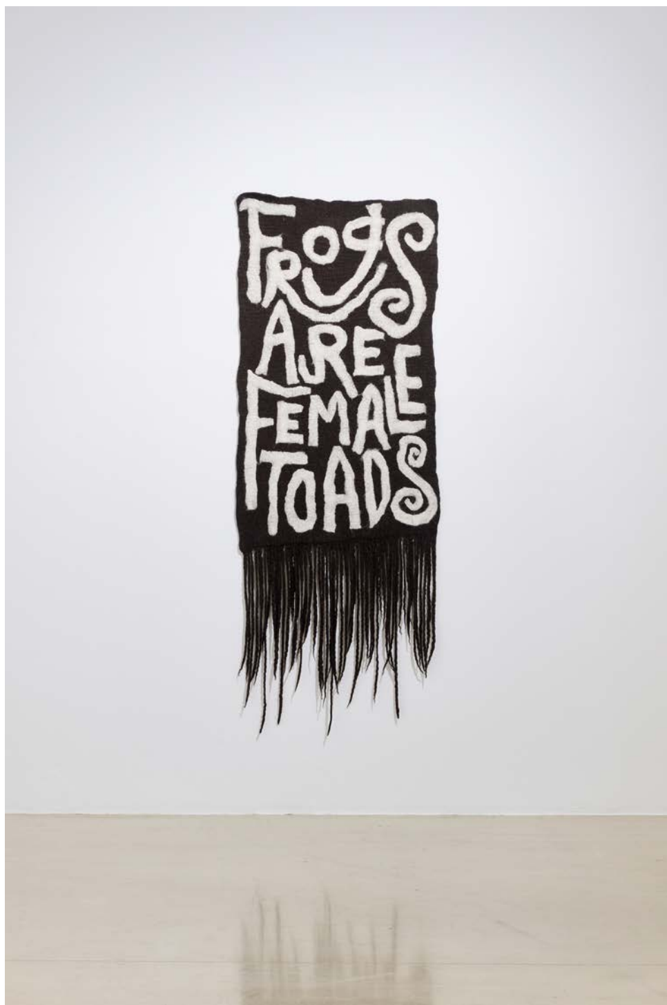
"Frogs Are Female Toads", felted raw wool from Hebridean, Tiroler Bergschaf and Merino, 200 x 80 cm, 2023.