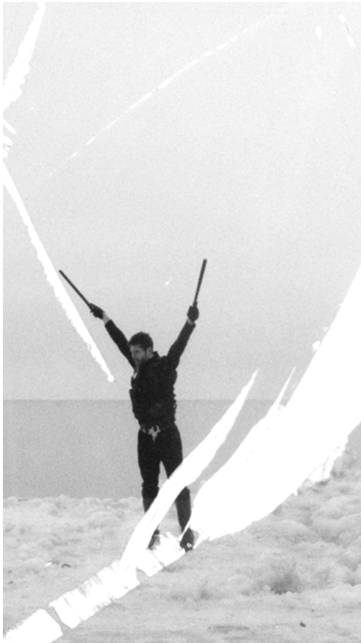
Karthik Pandian, Chrysalis , 2014, HD video still, Courtesy of the artist and Grimm Gallery, Amsterdam

The butterfly in the chrysalis is not only blinded but also suspended, weightless. I imagine it's an experience not altogether unlike floating in a sensory deprivation tank, which is something I've been doing in lieu of going to the studio lately. The «films» I work on in there are like a cinema of pure potential – timeless, edgeless, disembodied. This blindness can be productive; it puts pressure on appearance, makes you see differently, etc. But there's also a Bartleby dimension to it. A preference not to produce. An effort to accumulate instead of expend intensity. An attempt to commune with sheer negativity that perhaps draws us closer to being. The purest light is the imagined light, the one that emanates from our consciousness, projected into the void [...].