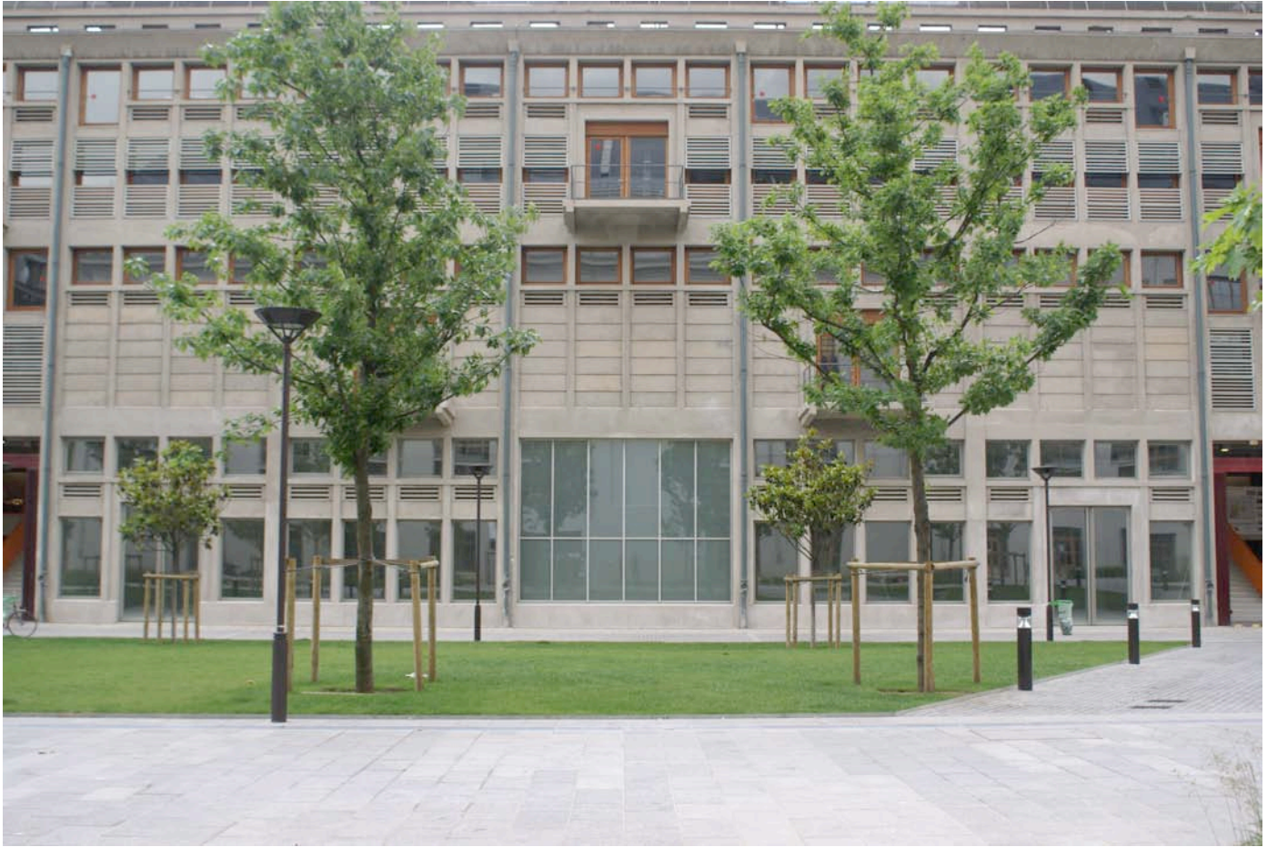
Facade of Bétonsalon